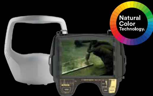
Part No: 06-0000-30i-KIT Welding filter and front cover 9100XXi

Read more about the new 9100XXi welding filter on page 16.