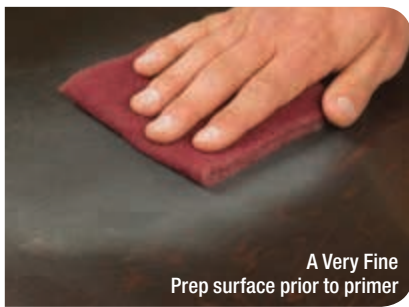
A Very Fine Prep surface prior to primer