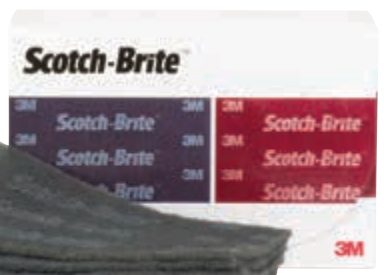
Scotch-Brite™ Durable Flex Hand Pad A VFN PN64659, Maroon