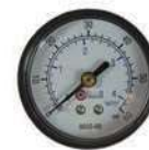
8800-60 0-60 psi with 2" Dial