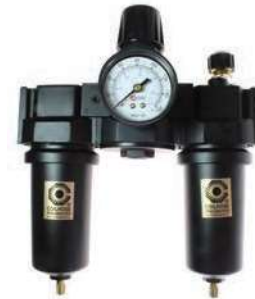
Filter, Regulator, Lubricator Trio