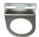
27RBA Mounting Bracket