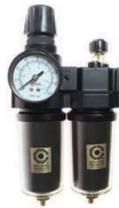
Filter/Regulator, Lubricator Duo